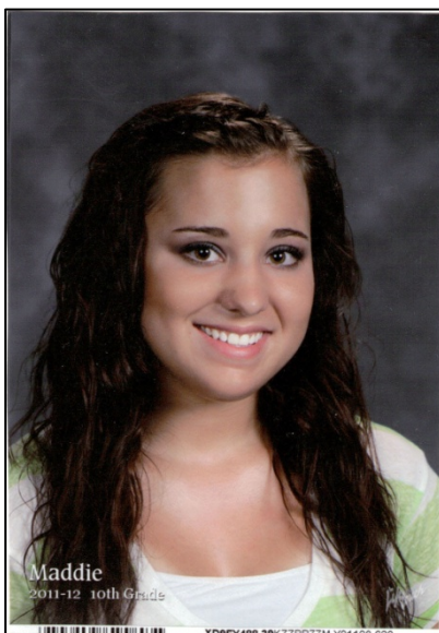
10 th Grade