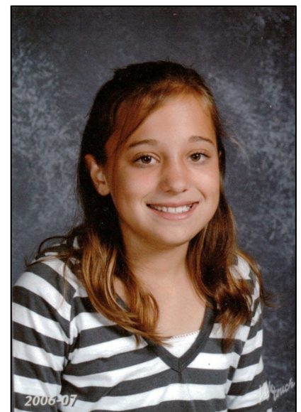
5 th Grade