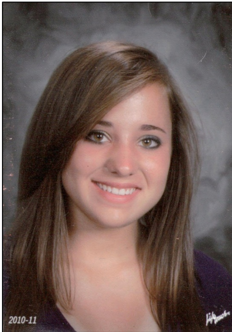
9 th Grade