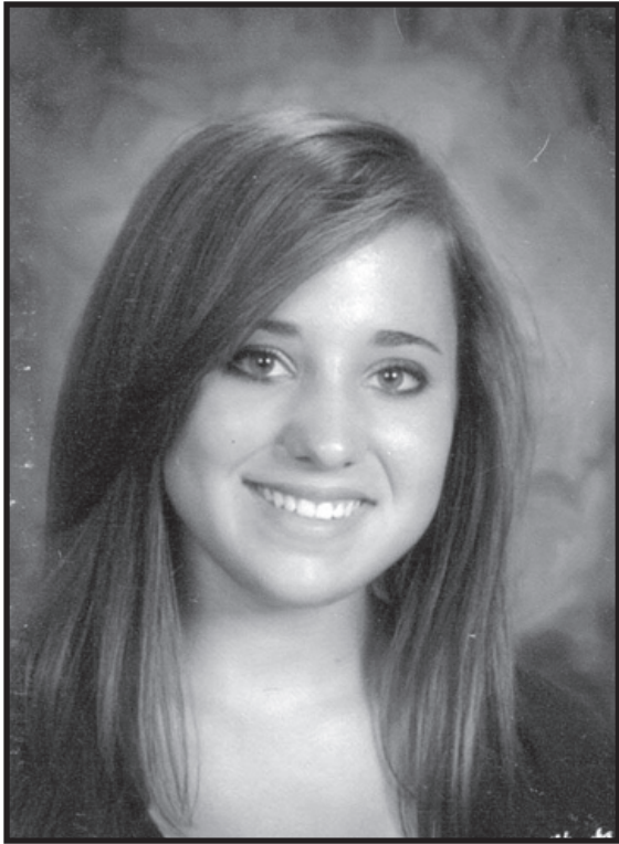
9 th Grade