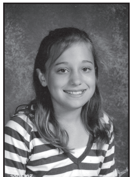
5 th Grade