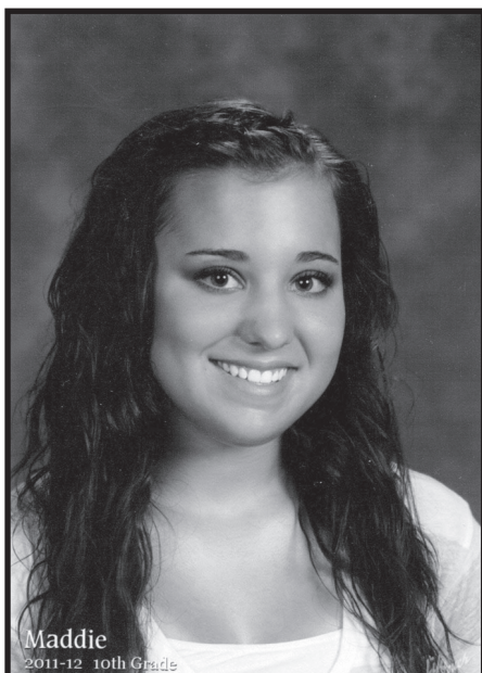
10 th Grade